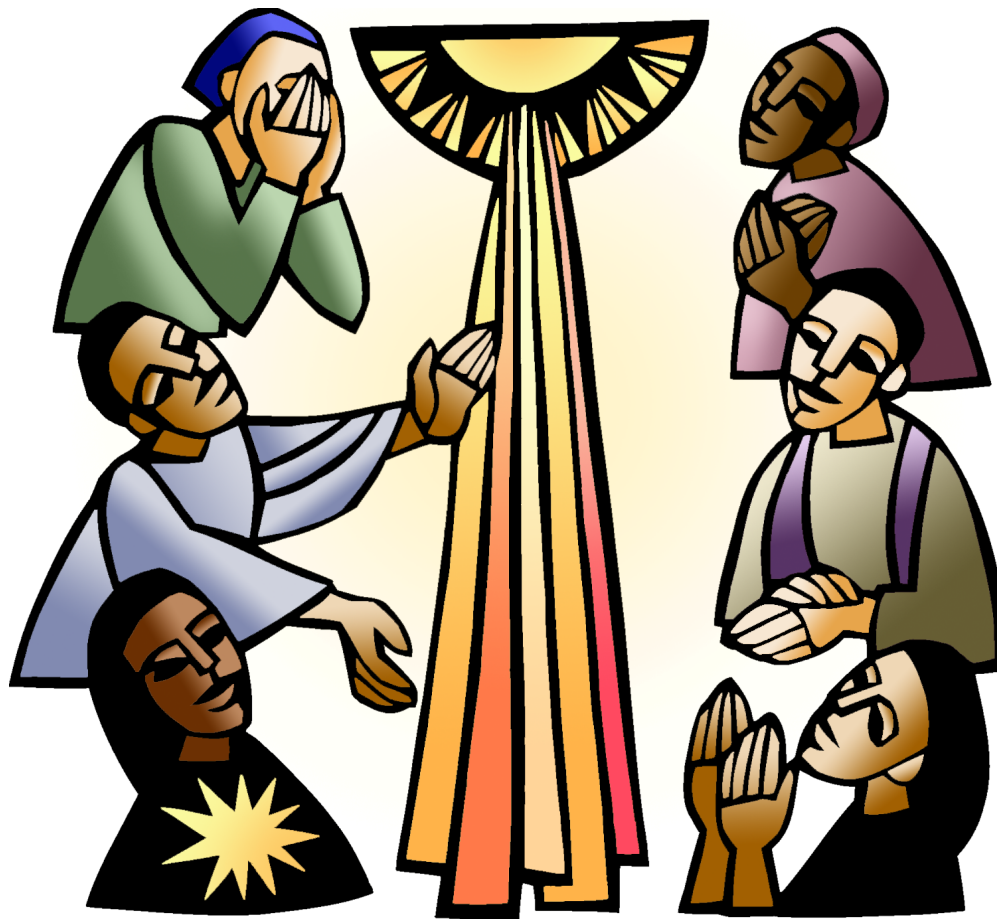
Clergy and Staff